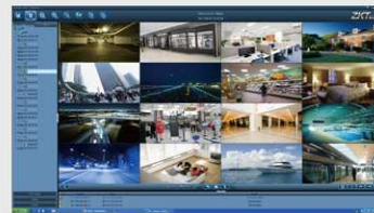
ZKVISION Software(Included in CD)