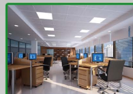
Time Attendance: Office