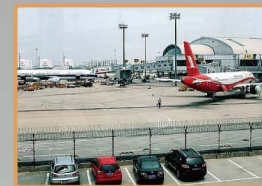
Standalone Access Control: Airport