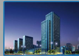
Networked Security: Building