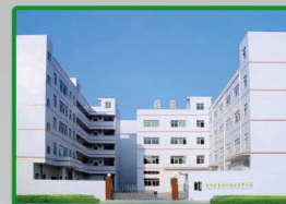
Time Attendance: Factory