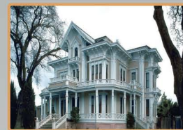
Standalone Access Control: House