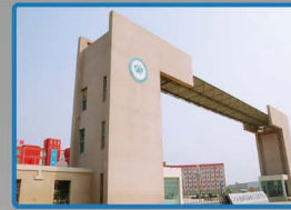
Networked Security: School